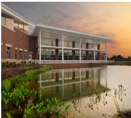
outdoor patio & rain garden